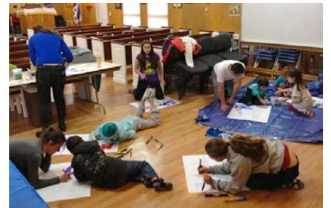
Preparing for the Purim Carnival