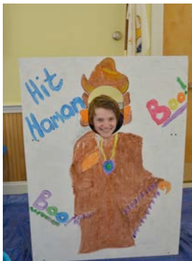
Haman being attacked!