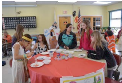
Putting desert sand in a bottle