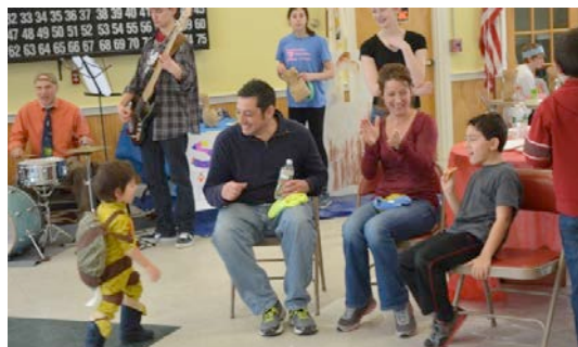
Fun for all ages!