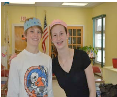
Two Queen Esthers