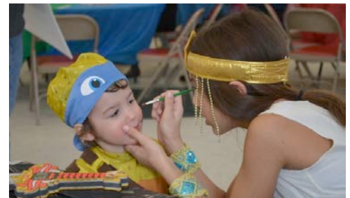
Face painting is always a favorite!