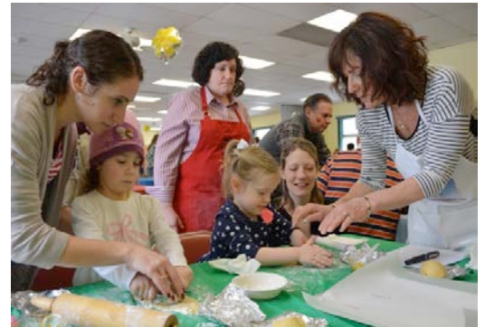
Learning how to make hamentashen