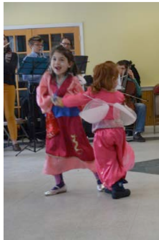
Dancing to live Klezmer band